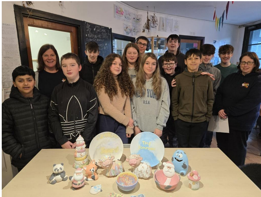
Image: Brora Youth Room members and Brora Development Trust staff, at The Clay Studio

Taking young people on trips offers far more than just a day out: it helps build confidence, independence, and social skills while giving them opportunities to explore new environments and learning. Our recent Brora Youth Room youth club trip was a wonderful example of how meaningful and memorable these experiences can be. Most importantly, they create lasting memories and a sense of belonging.