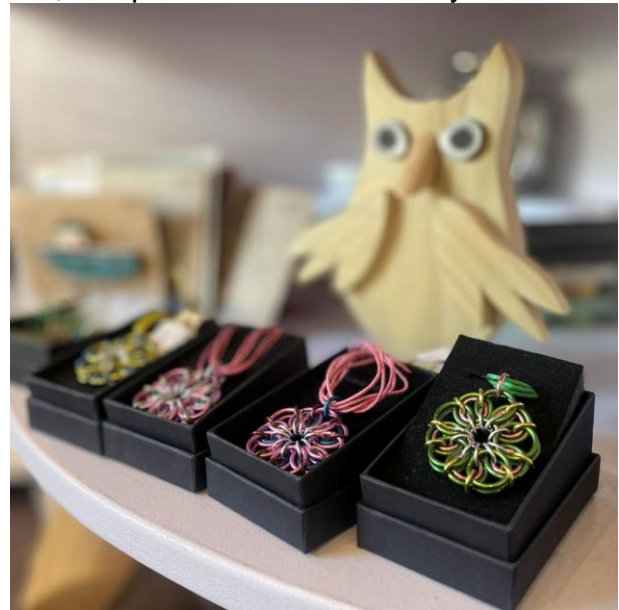
Pendants from Isla's Jewelry Box

A visitor information point can also be found in the shop, providing information to visitors on where to eat, sleep and what to do locally.