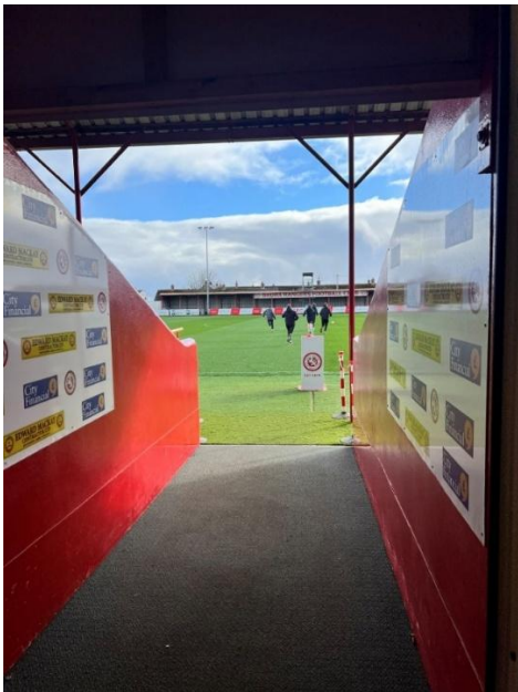
Brora Rangers Football Club

Brora Football Heroes is a project celebrating the unique football heritage of Brora and the wider Clyne Parish. The project is funded by The Scottish Football Museum at Hampden through the Heritage Lottery Fund. The aim of the project is to celebrate football in our community and highlight Brora's contribution to Scotland's Football heritage by working with our local clubs and the community to uncover and document the stories we have to tell. The project will also help us tell Brora's football stories in our new Museum.