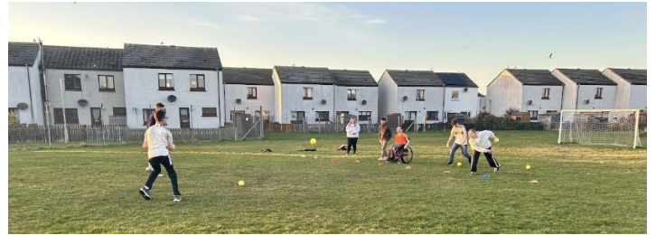
Games with Highlife Highland during the Easter School Holidays, at Muirfield Football Field