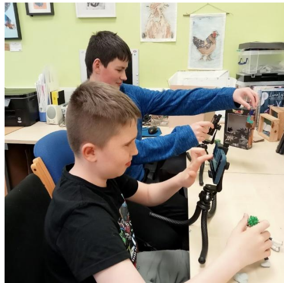
Young Animators working on a stop-frame animation

Animation Club has been running again, back by popular demand. The weekly two-hour session began in the last week of March and there will be 10 sessions in this block. Animation Club is run in partnership with local group, Brora Gallery Social Enterprise and delivered by a professional digital Animator.