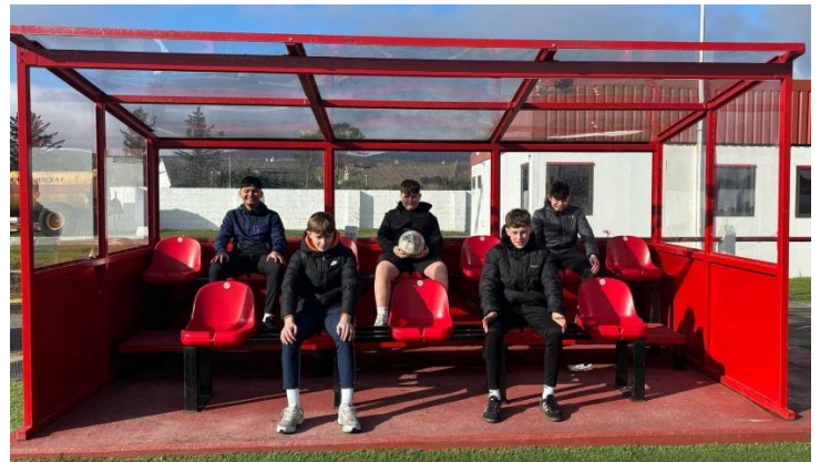
Young film makers from Golspie High School

Clyne Heritage Society (CHS) is fortunate enough to have access to a large number of football photographs and newspaper articles but we would like to grow this collection with the help of the local community by collecting oral histories from players, former players, key people involved in the teams, supporters and members of the local community. We held a drop-in session at Brora Rangers FC Social Club on Monday 10th March where people dropped in to see a display of photos and memorabilia as well as bringing along their own collections. We plan to host 3 more of these sessions over the coming months. The next session will be on Monday 26th May at 2pm.