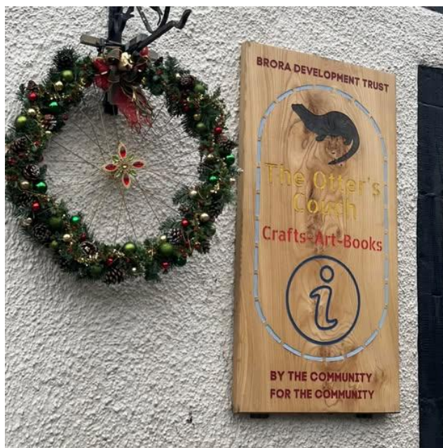
The Otter's Couch looking festive!

The Otter's Couch was just one of the shops in Brora which opened its doors on Brora's Christmas shopping evening on 30 th November.