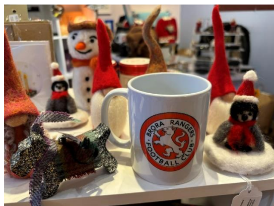
Brora Rangers mugs on sale

The Otter's Couch is fully stocked with gifts for Christmas including Highland Wildlife 2025 calendars and these great Brora Rangers mugs!