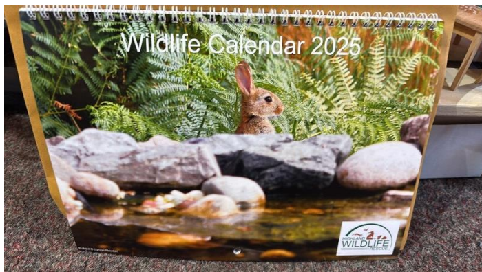
Highland Wildlife 2025 Calendar

Festive treats and a warm welcome across Brora village centre, were enjoyed by all. This was the first year that the shopping evening had taken place on a Saturday and participating retailers reported a steady trade of festive shoppers.