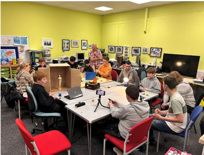
Animation Club well underway

the last quarter of this year an Animation Club ran for 10 weeks, in partnership with Brora Gallery Social Enterprise and delivered by a professional digital animator. The Animation Club was funded by SSE Gordonbush. This was attended by 12 young people who thoroughly enjoyed the 2-hour sessions every Monday, during which they learnt to create incredible animations digitally. We are now exploring ways we can share these animations with a wider audience, to share the work of the young animators.