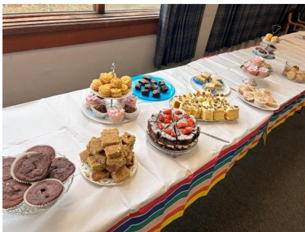
A bake sale run by the members to raise funds

Youth Room members also work hard to raise funds themselves. A recent bake sale and coffee morning raised just under £180 for the youth room, which has been used to buy sports equipment at the request of the members.