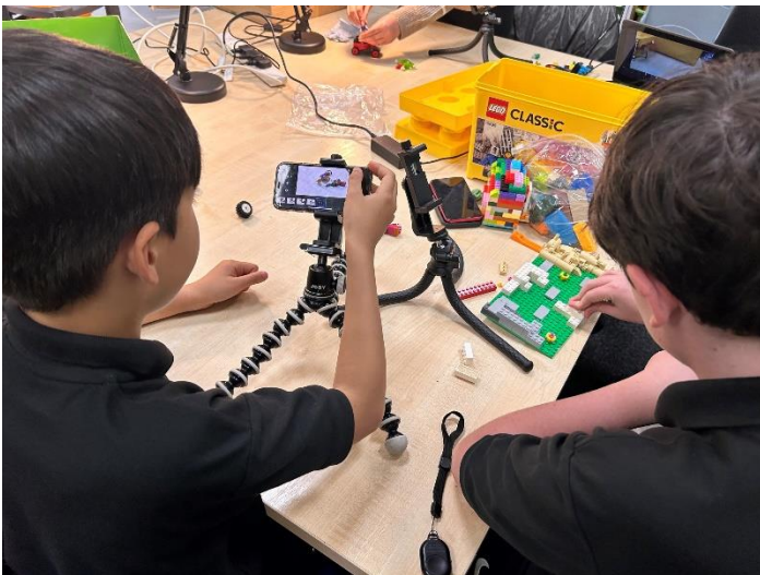
Creating animations using digital technology

Following extremely positive feedback from participants and all those involved, the Development Trust are seeking funding to continue the Animation Club in 2025 and take the young people's learning to the next level.