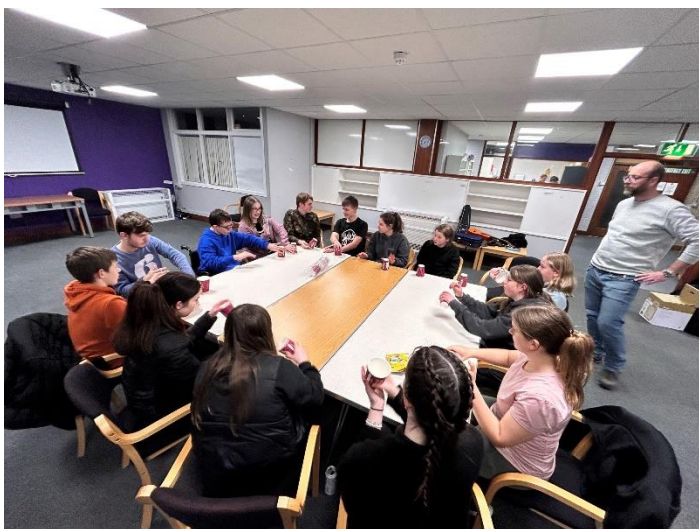
The music session with Feis volunteers was very popular and ended in an impromptu ceilidh