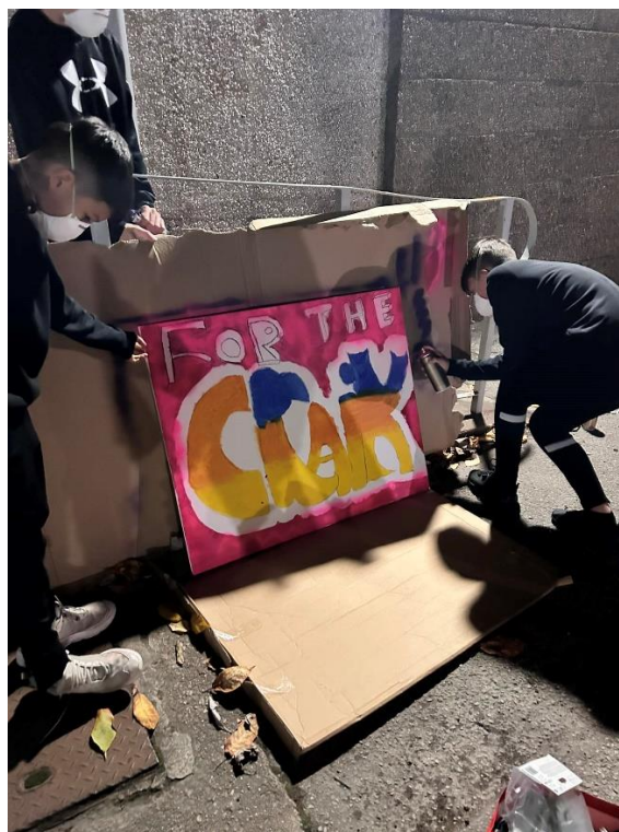
Some of Brora's young artists at work

These creations capture key words or phrases that reflect what Brora Youth Room means to the young people. The canvases will be displayed on the walls of the youth room in the community centre. Plans are being made to create a larger piece of outdoor graffiti artwork.