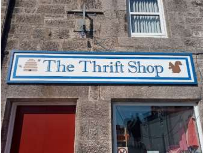
The Thrift Shop, Gower Street, Brora

The Thrift Shop on Gower Street, Brora was set up around 20 years ago and over the years has generously donated to dozens of local community groups and organisations.