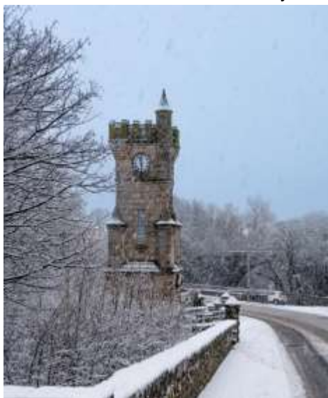
Image: Clyne Parish War Memorial

This is the first newsletter of 2024 and is full of news about the work that Brora Development Trust has been involved with this winter and news from local football team Brora Wanderers in the 'Community Corner'.