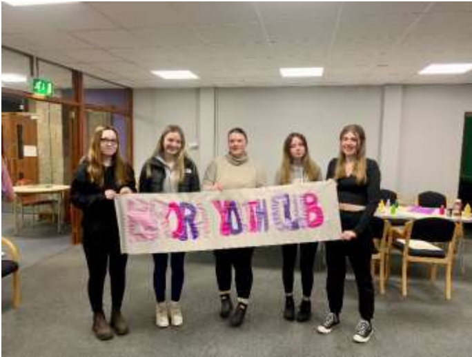
Image: Brora Youth Group members and Lead Youth Worker (centre) with their hand made banner

helping to celebrate the impact that youth work has on improving the local community”