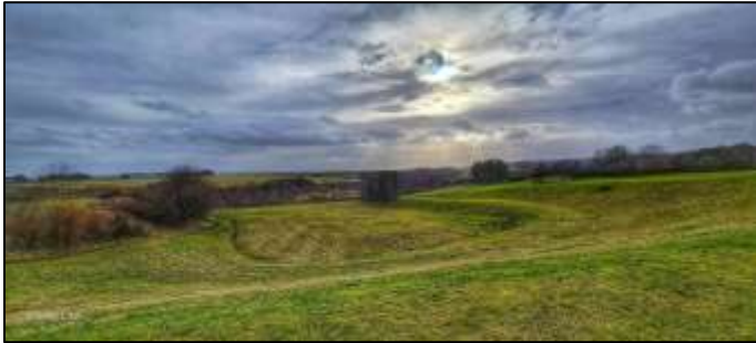
Image: View over Fascally Park

An environmental assessment is underway this week at Fascally Park, with the permission of landlords, The Highland Council.