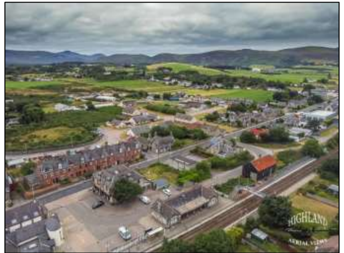
Image: Brora village from above

A short leaflet "Are you prepared for an Emergency" giving reference contacts and recommendations for preparations, will soon be delivered to Brora households by local neighbourhood volunteers.