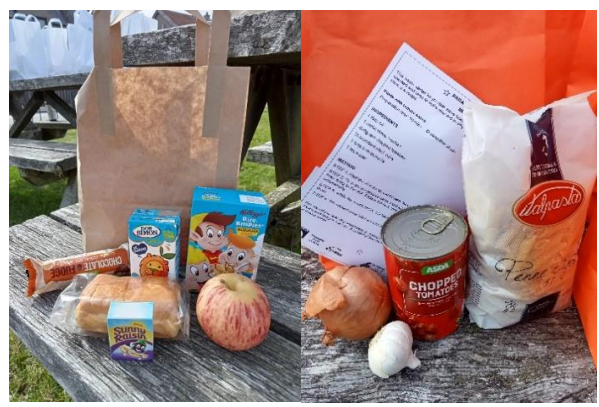
Breakfast pack and Meal Starter Kit

Brora Development Trust, Engaging with Activity at Brora Village Hub, and Young Carers Sutherland (TYKES) have been working together to respond to an increase in demand for support locally as a result of the cost of living crisis and made breakfast packs and meal starter kits available throughout the school summer and October holidays for all school children living in Brora.