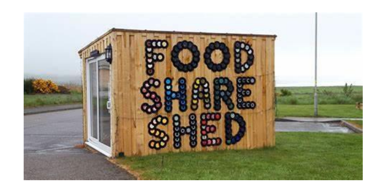
Food Share Shed, Brora

charity CFine which provides food surplus and from kind donations from individuals. The Shed was set up to help reduce food waste in landfill and help fight climate change. The Shed was originally funded by Tesco and Kilbraur windfarm.