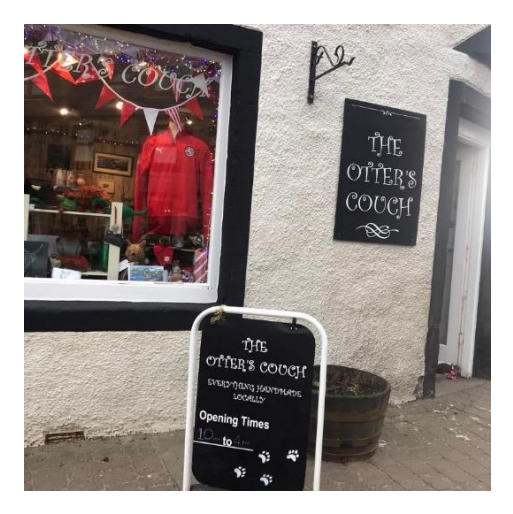
The Otter's Couch, Rosslyn St, Brora

The Otter's Couch celebrated three years of successful operation in April this year. The social enterprise continues to thrive and attracts local customers and visitors alike. Over 40 local crafters and artists sell their produce in the shop, with local charities also supported. The shop is staffed by volunteers, crafters and one parttime paid employee. Brora Rangers football club also have merchandise for sale in the shop. Current opening hours are: Monday to Saturday,10am to 4.30pm.