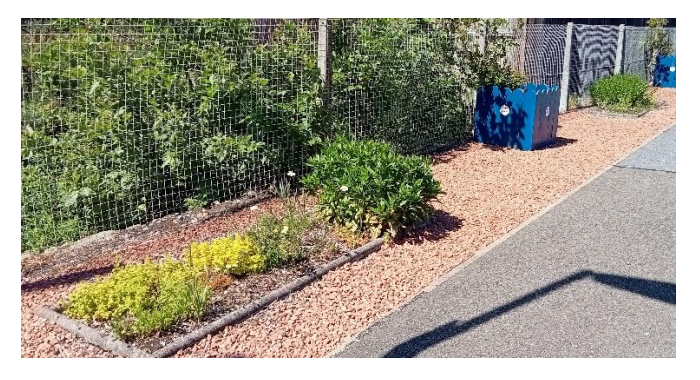
Flower beds, Brora train station